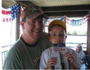
The Winner and Son