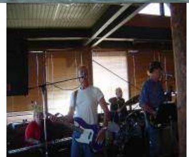
Spring Series #7